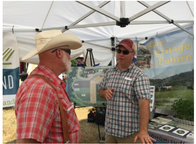
C. Beef Cattle Farmer with Snohomish Conservation District Farm Planner at Silvana Fair (8/8/18)