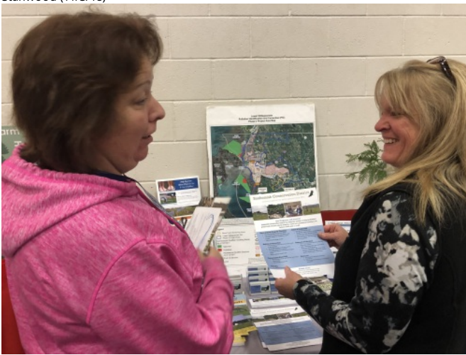
I. Snohomish Conservation District Lead Farm Planner at Country Living Expo in Stanwood (1/26/19)