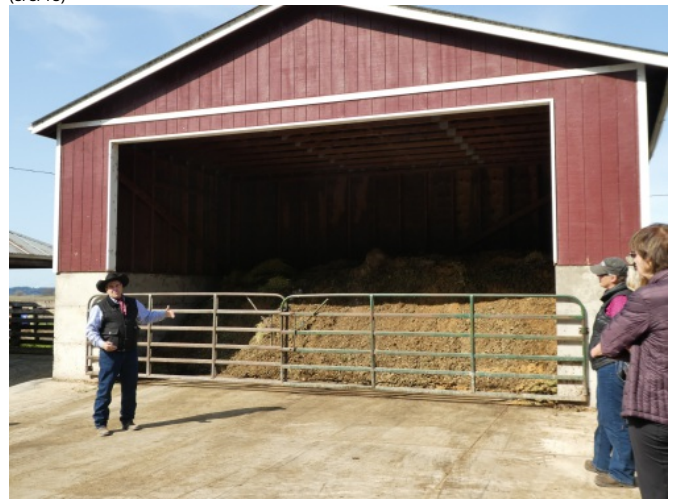
J. Snohomish Conservation District Sound Horsekeeping Farm Planner at Warm Beach Camp Horse Farm Tour (3/23/19)