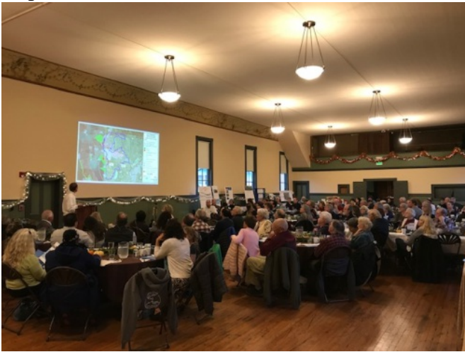
F. Lower Stillaguamish PIC Phase 2 presentation at Stillaguamish Shellfish Dinner in Stanwood (11/3/18)