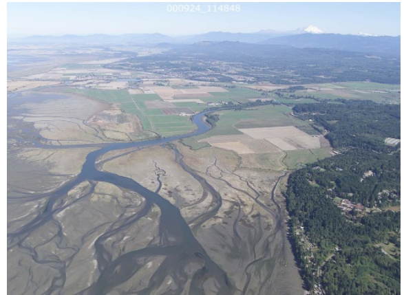
A. Stillaguamish River estuary looking north toward Stanwood

Snohomish County will continue working with partner agencies to expand and enhance the Lower Stillaguamish Pollution Identification and Correction (PIC) effort to include additional focus areas for proactive targeted water quality monitoring, pollution source tracking, regulatory compliance coordination, education and outreach, technical assistance, and cost share incentives. This work will help Snohomish County fully implement the Port Susan Pollution Response Plan that the County will adopt and begin implementing in March 2019 as required by the Washington Department of Health due to the 2017 downgrade of 190 acres and 2019 downgrade of 350 acres of the Port Susan shellfish growing area.