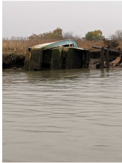
Sunken Boat in Snohomish Estuary