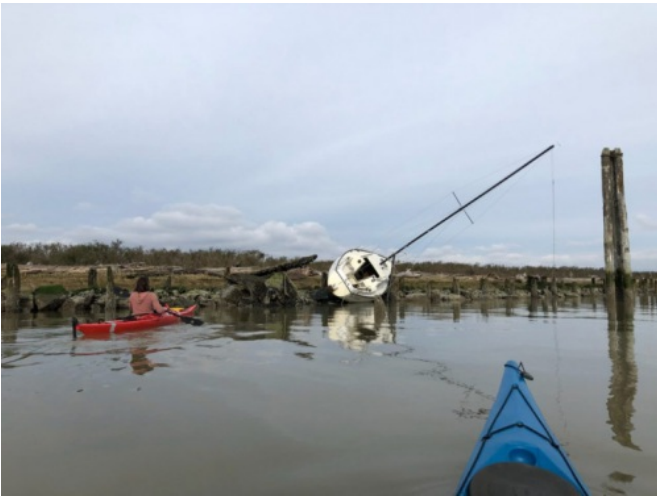
Derelict boat on Jetty Island