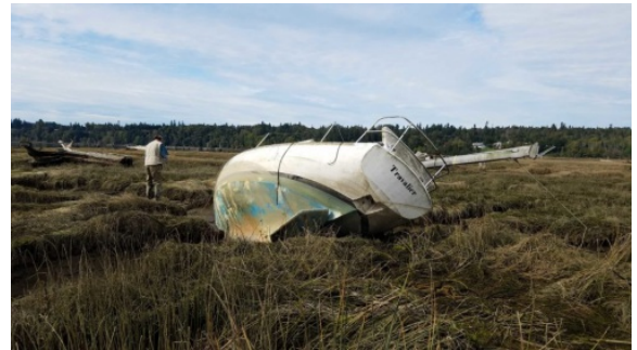
Derelict Boat in Snohomish Estuary

This project provides support to the overall recovery of the Snohomish River Estuary, a critical habitat for salmon populations, by addressing and removing derelict vessels. Derelict vessels negatively affect salmon population by producing point sources of pollution; both toxics and nutrients. This project will also remove harmful structures from critical riparian habitat salmon population utilize on the Snohomish River. Snohomish County Marine Resources Committee (MRC) will work with Department of Natural Resources (DNR) under RCW 79.100 to prioritize and remove derelict vessels. This project addresses the Chinook Vital Sign 7.1.