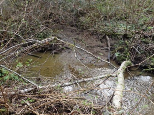
Habitat downstream of the culvert