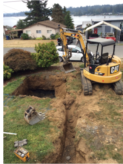
Septic replacement for a low-income grant recipient through Savvy Septic